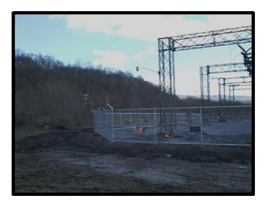
For the answer see page four of the Trekker.

Can you identify where and when this photo was taken: